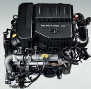
1.5L Revotorq Diesel Engine (260 Nm torque)

All-new petrol and diesel engines with powerful & sporty performance. Turbocharged , with a power output of 110PS (80.9kW) to set your heart racing.