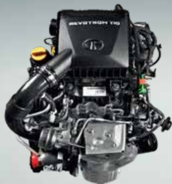
1.2L Revotron Petrol Engine (170 Nm torque)

Absolute control for every drive. Cornering stability with anti-lock braking system and electronic brake-force distribution in all 4 wheels with hydraulic assistance for emergency braking.